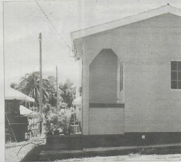
The houses that were handed over included three, units.

Prime Minister Gonsalves recognized the role of the Mustique Charitable Trust in helping to stabilize the situation of disruption caused by the volcanic eruptions.